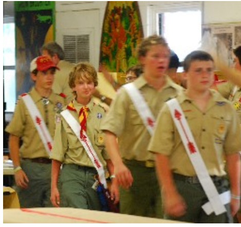
New Brothers Entering the Dining Hall