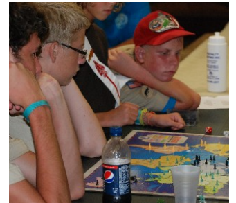
Members Playing Risk in Aal-Pa-Tah Tradition