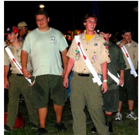
Lodge Members at the Pow Wow