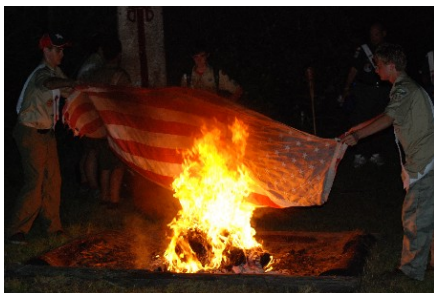
Retiring Flags on Sept. 11